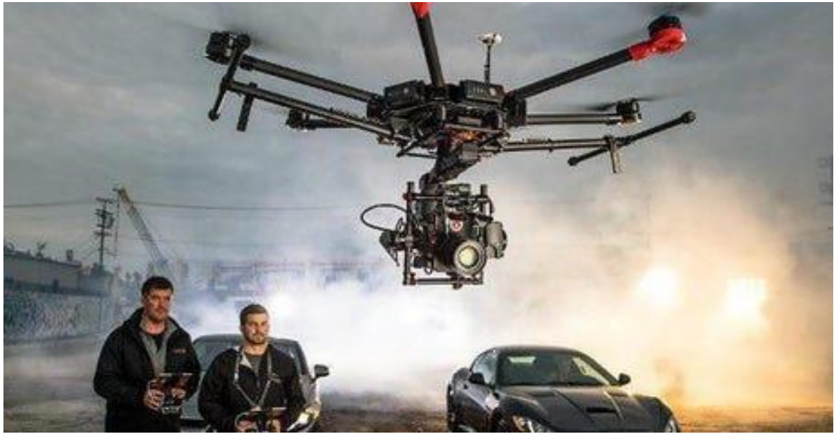
Figure 2 A drone is usually controlled by operators on the ground [2].