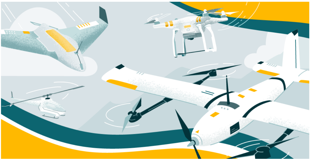
Figure 3 Some surveillance drones [6].