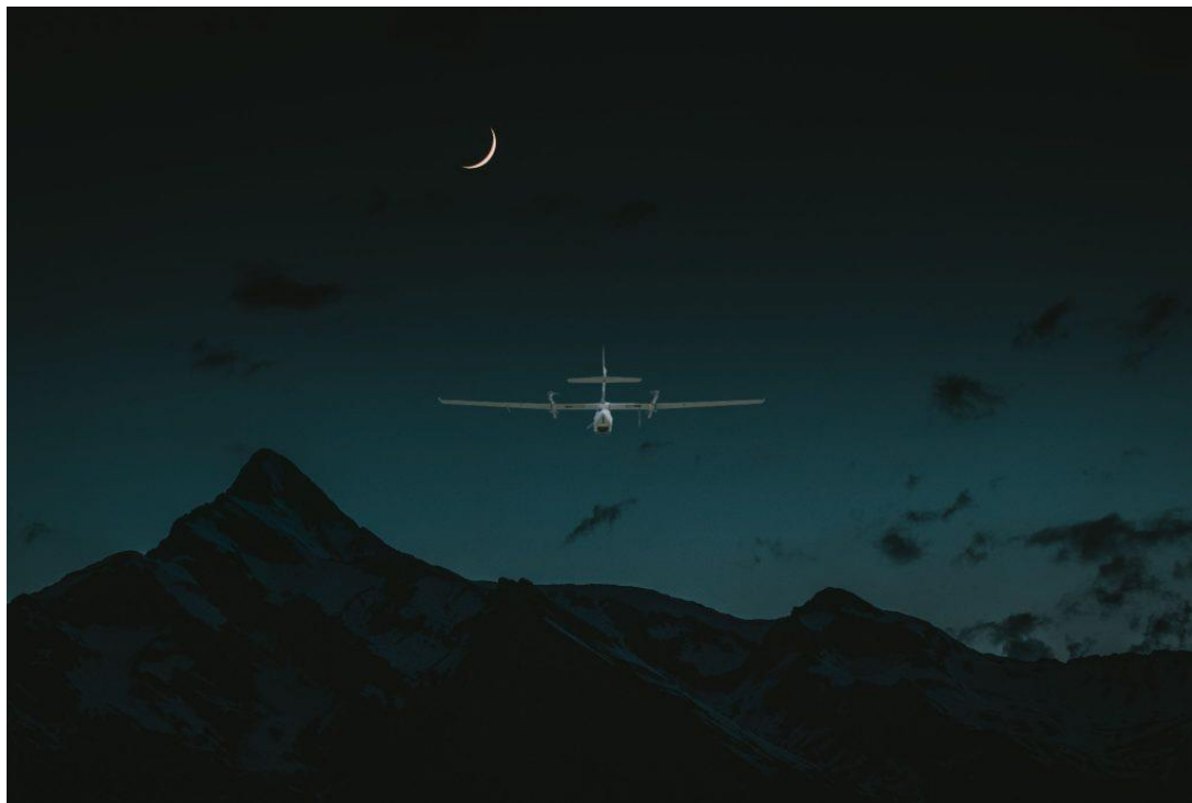
Figure 5 A surveillance drone designed for night operations [8].