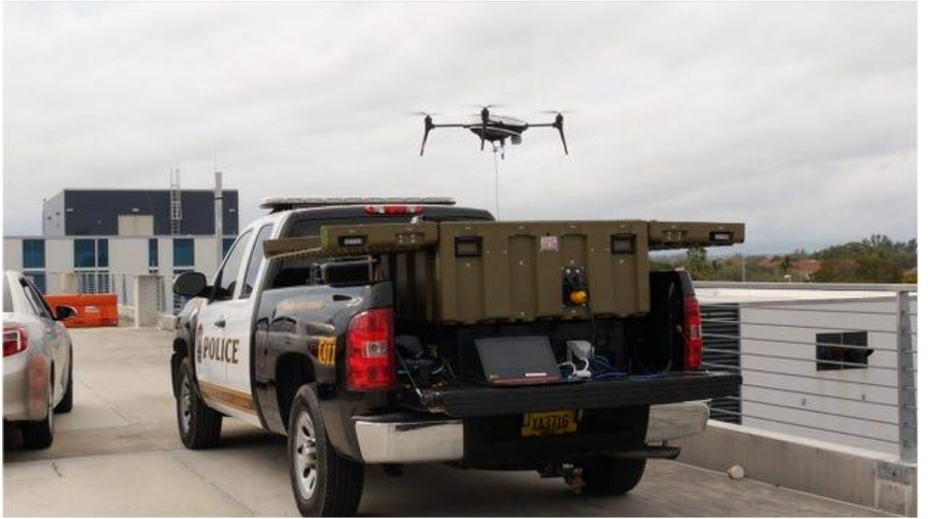
Figure 6 A police drone [2].