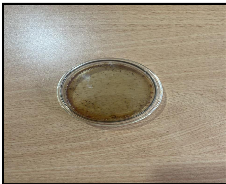
Figure (11): The hyacinth plant extract after dried

metabolites such as flavonoids, ,protei alkaloids, phenol, steroid, tannin and saponins ,sterols, terpenoids and Coumarin [30].