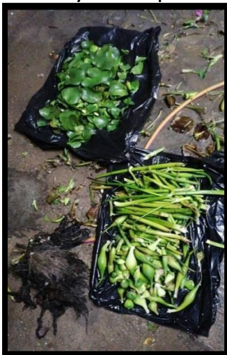
Figure 1 : hyacinth plant after wash